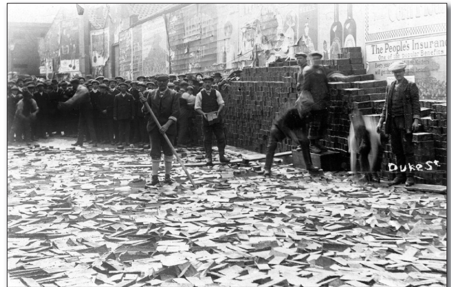
Clearing up the wooden bricks road displaced by the flooding on Duke Street, Norwich.

The Henry Branch of 1938 is a far lesser known flood but it should not be forgotten. It occurred when an abnormally high and violent tide caused over 500 yards of dunes to collapse and the water poured through flooding 2,500 acres of low-lying hinterland. Fortunately no human lives were lost but many farm and wild animals were drowned. The