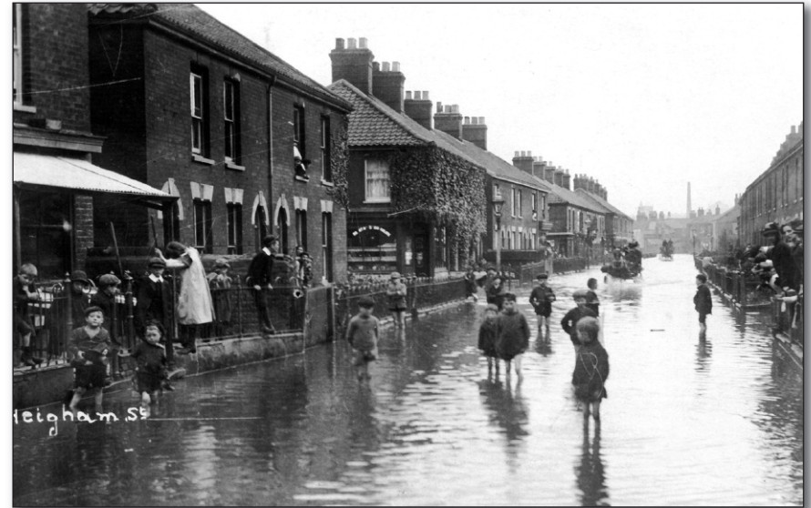
Heigham Street, penetrated by some of the first flood waters in the city during the 1912 floods.